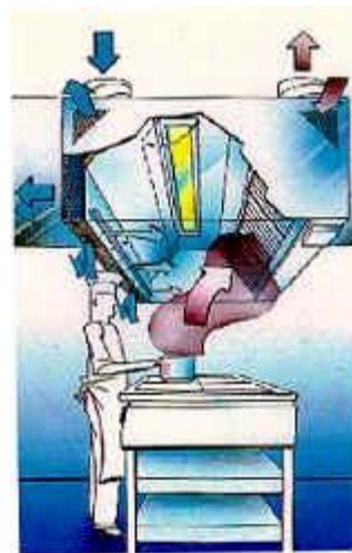
Innovative commercial cruise ship kitchen ventilation design with grease interceptor hood and air hood (Graphic created by Halton)

In the latest galley ventilation design aboard Navy and commercial ships, a high efficiency grease interceptor hood is installed over each grease-generating piece of equipment such as ovens, griddles, and fryers. The grease interceptor hood removes combustion gases, heat, grease, dust, lint, and odors generated from galley cooking operations. Grease, dust, and lint are centrifugally extracted from the air stream within the hood; eliminating fire hazards and maintenance problems due to these contaminants accumulating in the