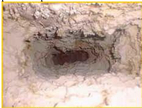
Buildup of dirt obstructs airflow through ventilation system

Ventilation systems include a supply, or makeup air system and an exhaust system. Supply systems replace contaminated air exhausted from a workspace with uncontaminated outside air. Supply ventilations systems also provide replenishment air to air conditioning recirculation systems. Exhaust systems remove odors, heated air, and airborne contaminants from the workspace. Both supply and exhaust airflow quantities must be balanced.