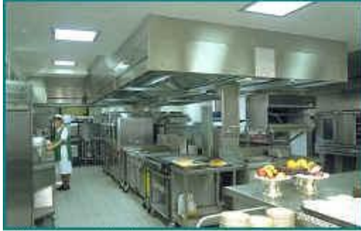
Simple ventilation systems can result from reduced amount of equipment galleys

Since 1997, the Navy has identified and field-tested several types of advanced food service equipment such as: the combination convection oven/steamer, skittle, and clamshell griddle. Advanced food service equipment can replace multiple pieces of traditional food service equipment. Reducing the amount of equipment in the galley also reduces the need for more complicated ventilation systems and their