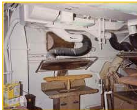
Ventilation for steam-press in laundry area aboard Navy ship

Local exhaust is required for processes such as welding and paint mixing and dispensing in paint storage areas. Specialized, portable exhaust blowers are often required for specific temporary projects such as welding or asbestos removal.