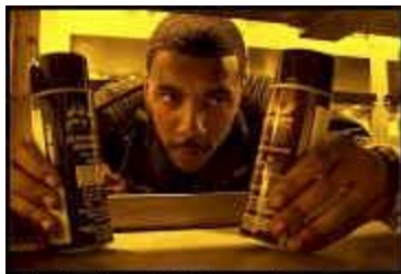
Selecting HM from storeroom

Another common ventilation problem associated with shipboard laundries and galleys is that airborne materials can collect in ducts unless a good pre-filtration system is available and effectively maintained. Large volumes of lint generated in laundries can partially obstruct airflow and serve as potential combustion sources. Grease and other cooking residues generated in galleys that collect in ducts can also become combustible. Ventilation duct fires are extremely difficult to extinguish.